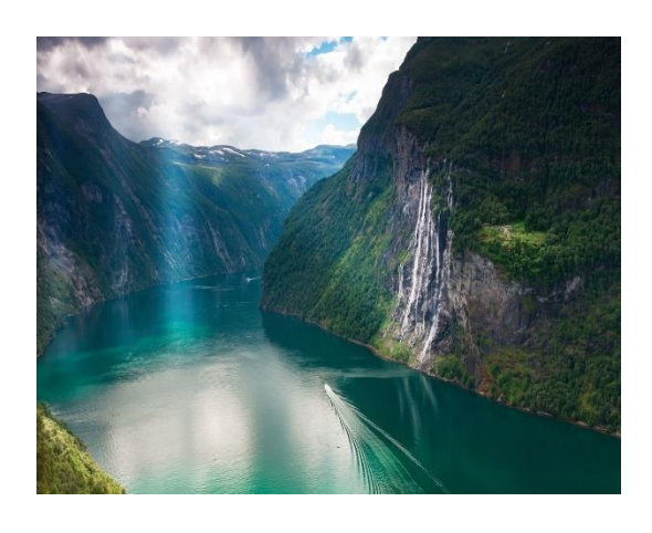
FREE CRUISE SHORE EXCURSION ($187 VALUE) REGISTER BY MAY 16