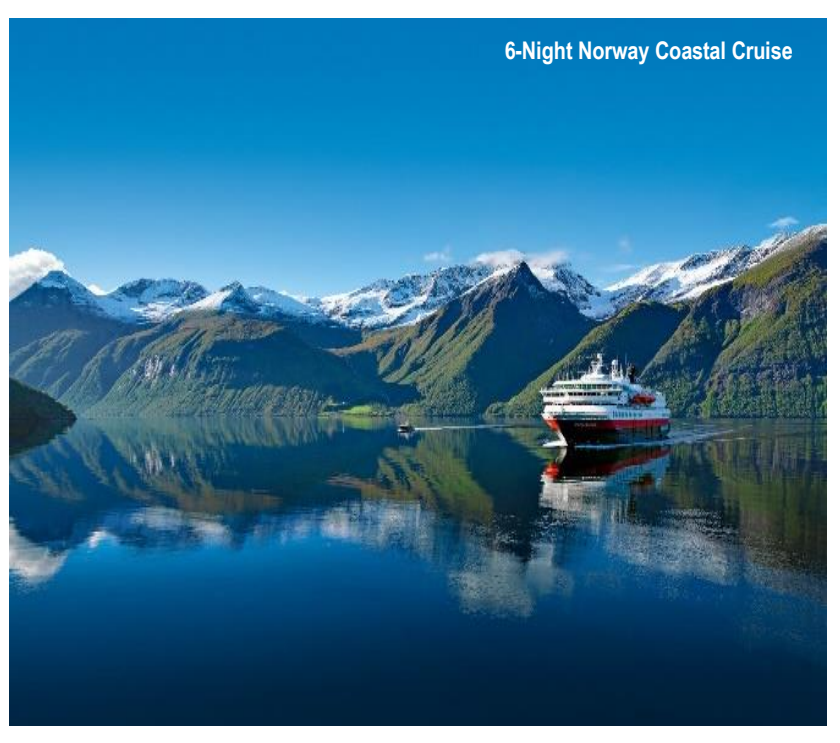
View the complete itinerary visit <u>LUTHERTOURS.com</u> At the top of the page click JOIN A TOUR , select this spiritual journey.