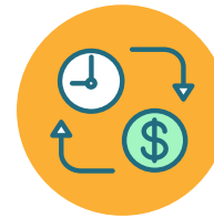
Automatic reoccurring gift