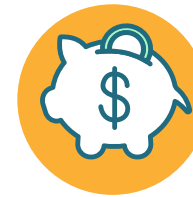
Stocks, bonds, and real estate