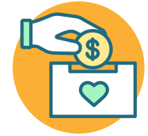
Contributions to an edowment