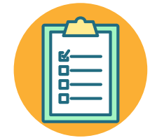
Wills and charitable trusts (estate planning)