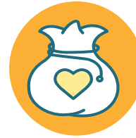
Beneficiary of retirement plan assets and distributions