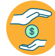
Beneficiary of a life insurance policy