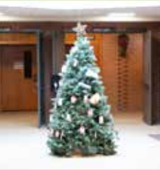
Mittens, hats, and scarves (Giving Tree)

URGENT Mission Needs: Men's Winter Gloves Men's Winter Hats Men's Winter Coats Chapstick Men's T-shirts (All Sizes) Men's Boxers (All Sizes) Hygiene items Donations can be dropped off at any Hope Campus or at New Life Center 1902 3rd Ave N., Fargo.