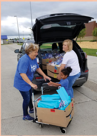
As we were preparing to launch, the Hope West Outreach Team delivered teacher gift packs to Liberty Middle School the day before teachers came back to the school for the new year.