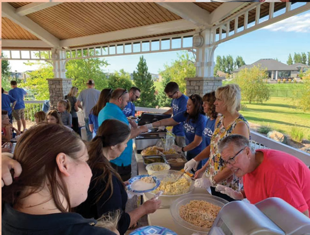
We had a great turnout at the August picnic celebrating the launch of Hope West. Food, fun, face painting, and fellowship...West Fargo here we come!