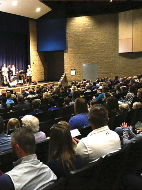
t worship, and 168 children and students to kick start the first day on September

Let's celebrate the latest addition to our worshipping community! It was a fantastic turnout for the launch of Hope Lutheran Church's West Campus.