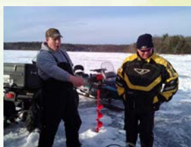
Men on Ice