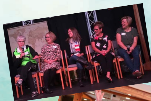
Coffee and Connections