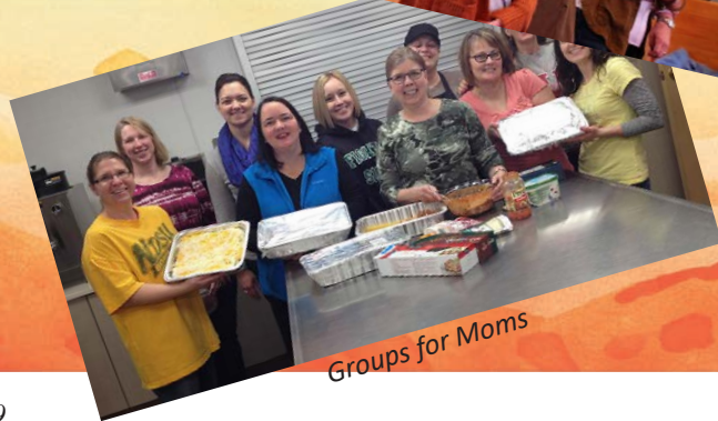
Groups for Moms