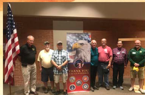
Veterans of Hope