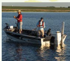
Men in Boats

MEN'S MINISTRY ALSO CALLED MEN OF HOPE, IS A MOVEMENT THAT ENCOURAGES MEN TO LEAD LIVES OF INTEGRITY AND PASSION AS FOLLOWERS OF JESUS CHRIST.