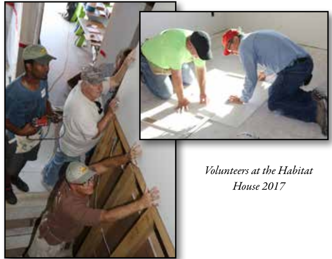
Volunteers at the Habitat House 2017