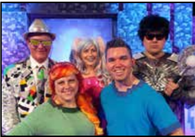
Cast of GODCRAFT

201 Volunteers at the South Campus and 74 Volunteers at the North Campus generously gave of their time and talents this year! The volunteers helped in a variety of ways: creating sets, serving supper, greeting families, helping with crafts, organizing snacks, praying with the Pixels, singing and dancing with the Pixels, just to name a few ways that they helped to make these two weeks a huge success!