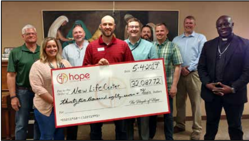
New Life Center staff accepting the check from the people of Hope Lutheran