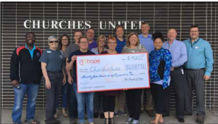
Churches United for the Homeless staff accepting the check from the people of Hope Lutheran